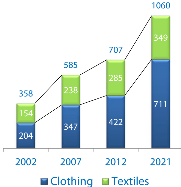
Global Textile and Clothing Industry Trade in USD bn